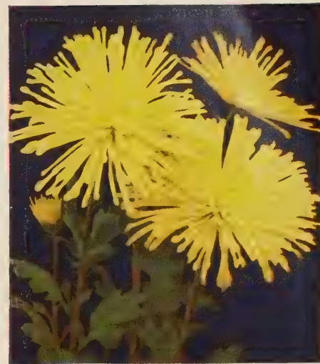
YELLOW SPOON. 60c each; 3 for $1.50